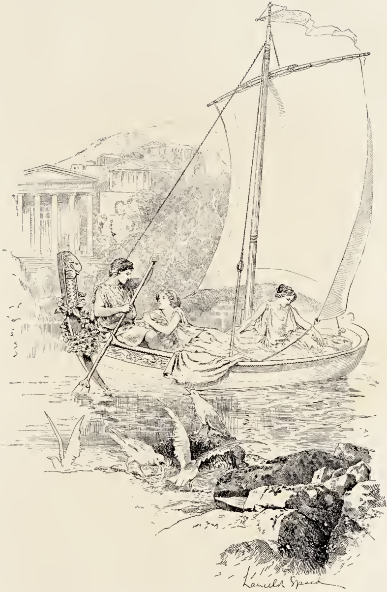
"As the last words trembled over the sea, Ione raised her looks."